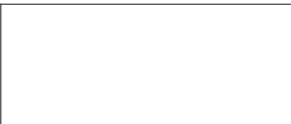
Figure 2. Figure legend.